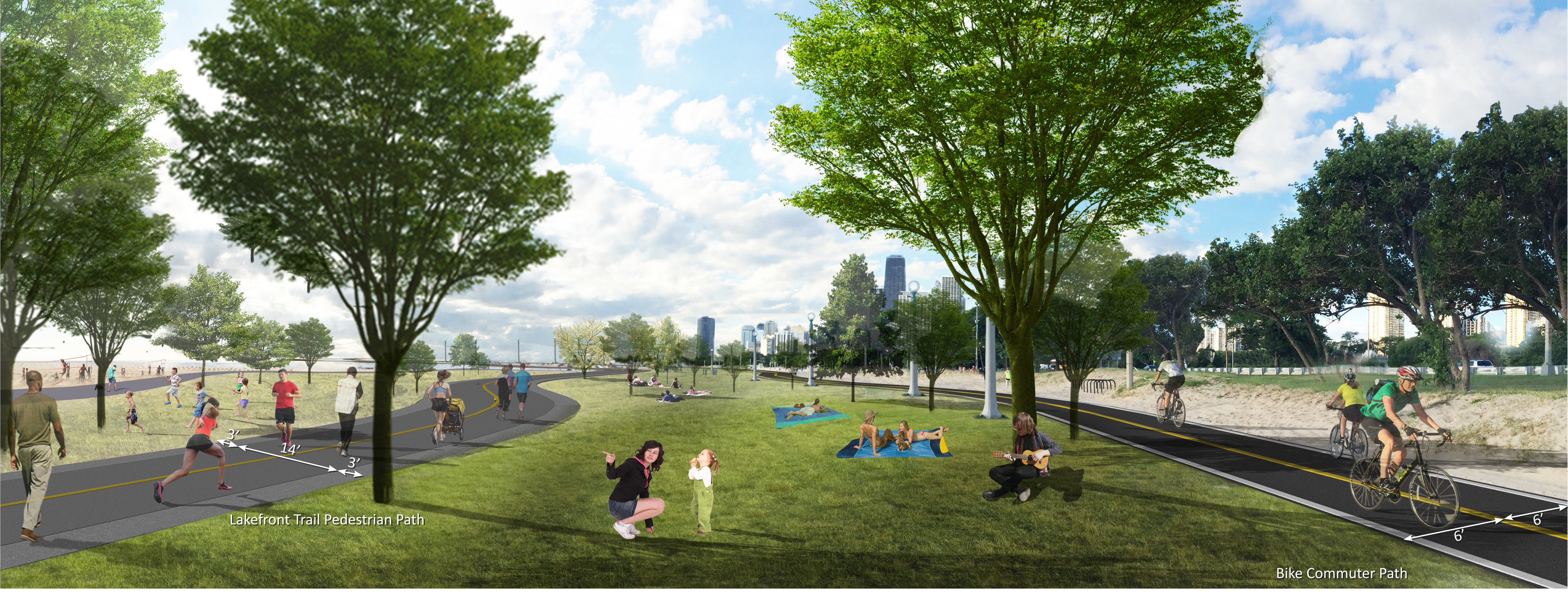
Perspective Viewpoint 1