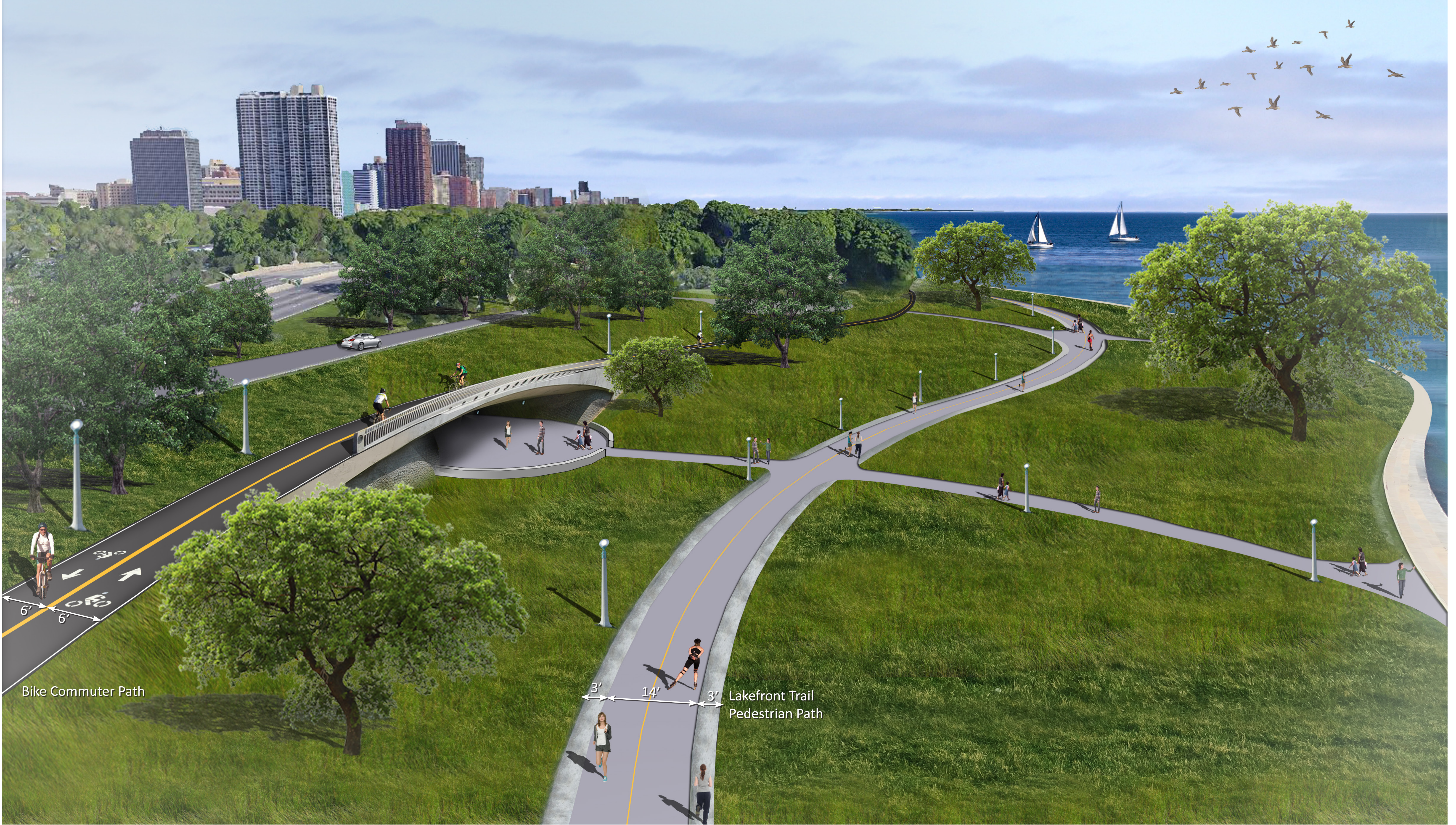
Perspective Viewpoint 2